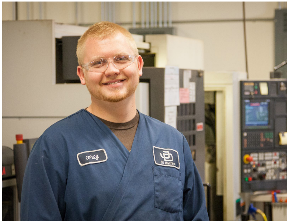
The Utah Legislature allocates Custom Fit funds each year to encourage companies to pursue training that will maintain and grow Utah’s businesses and economy.

Finally, involving private industry in the process of creating curricula for micro-credentials and other nondegree paths, as well as involving them in the funding process, are proven successful methods of public-private partnerships that should be expanded.